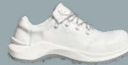
FOOD TRAX 5012856

S3 / metal-free penetration resistance Upper material smooth leather Inner lining fabric Replaceable, antibacterial insole (Art. 352800) Metal-free Slip-resistant PU outsole