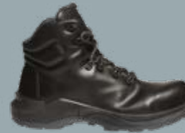
FOOD TRAX 5010857