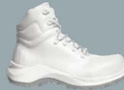
FOOD TRAX 5012857